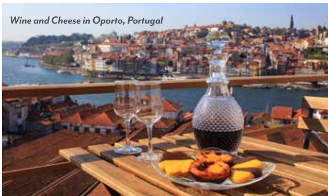
Wine and Cheese in Oporto, Portugal

Visit the UNESCO World Heritage Site of Santiago de Compostela, and stroll along medieval stone streets