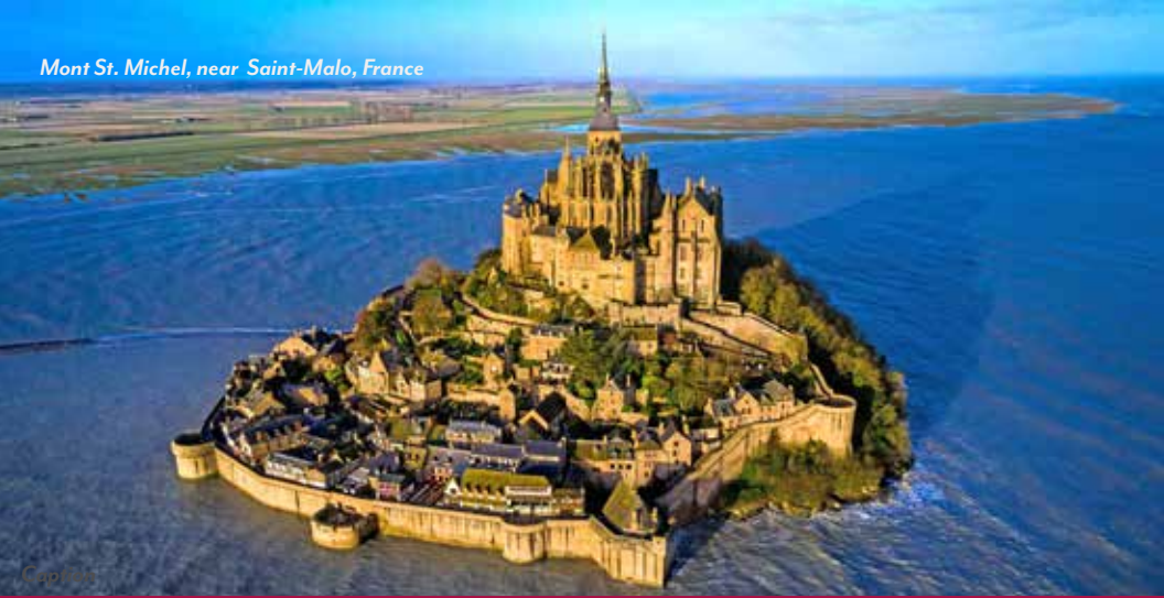
Mont St. Michel, near Saint-Malo, France

above the sea, the UNESCO World Heritage-designated Mont-Saint-Michel is a sight of soaring spires isolated beyond a stretch of saltwater marsh. This fortified village began as a humble oratory and became a renowned medieval center of learning. Cobblestone streets weave through the village, culminating in the Abbaye du Mont-Saint-Michel, a three-story Gothic masterpiece. Admire the serene cloisters, barrel-roofed réfectoire, and Salle des Hôtes of the 13 th -century La Merveille and the magnificent Église Abbatiale. (B,L,D)