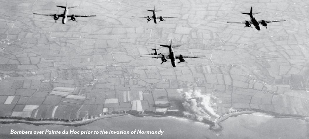
Bombers over Pointe du Hoc prior to the invasion of Normandy