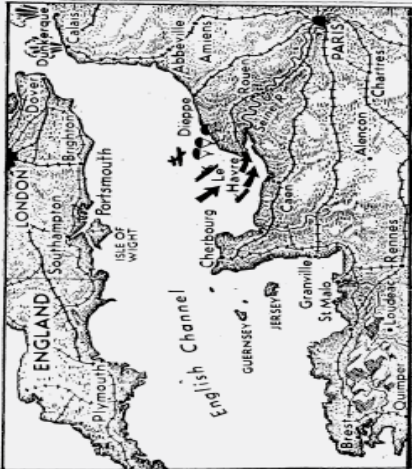
WHERE GERMAN REPORT FEAT OF ALLIED INVASION—Paris, where the invasion was reported today, is 100 miles from the English coast. The map shows the invasion route from the English coast to Paris.

LONDON, June 6 (AP)—The London news agency PNE said today that the German army troops had been reinforced at dawn at the mouth of the Seine river in the Le Havre area.