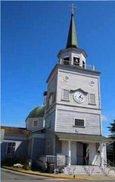
Saint Michael's Cathedral in Sitka