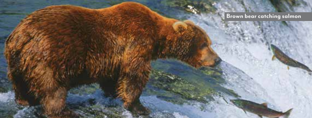
Brown bear catching salmon